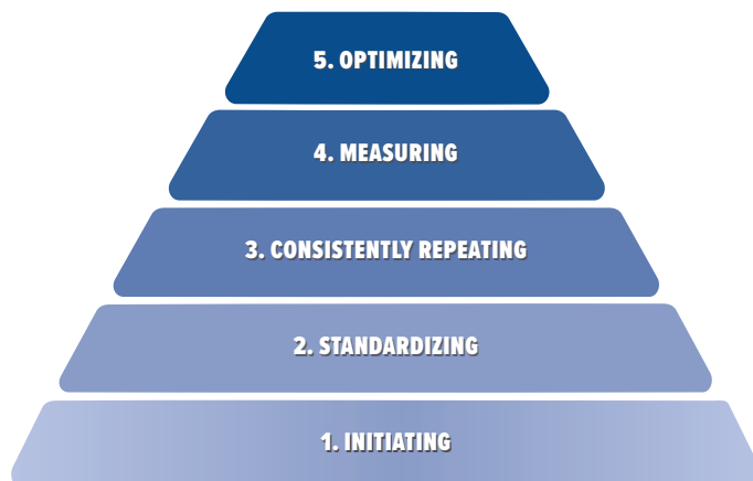
Levels of Portfolio Maturity